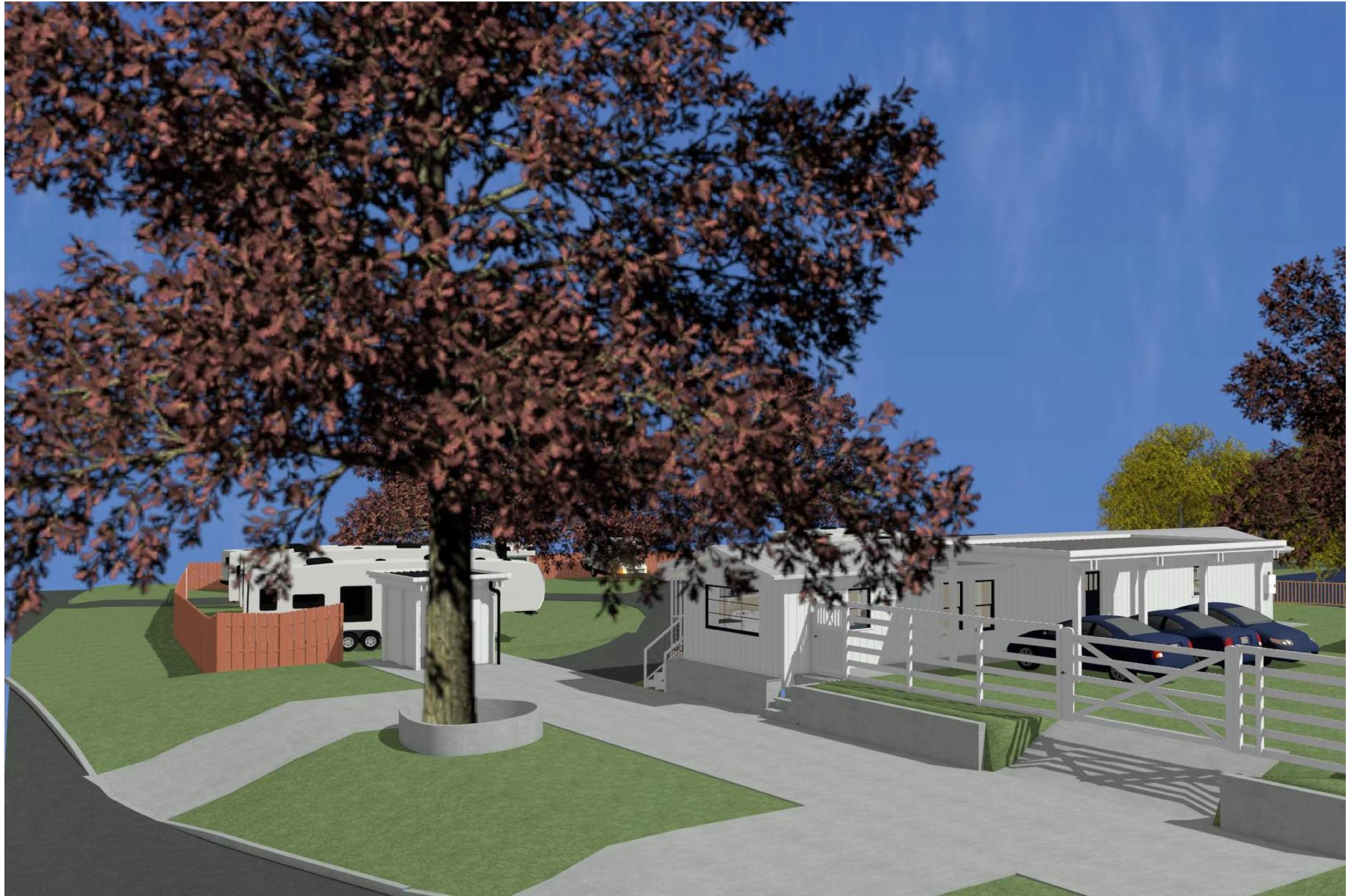
Anchor Marina Park